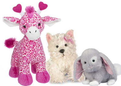
While supplies last. Items pictured may not be in stock.

Shop hours are subject to change. Please check our website for updated hours prior to visiting.