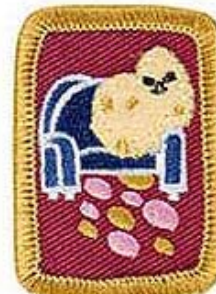
Couch Potato IP