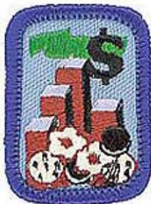
Cookies and Dough