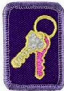
On Your Own