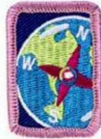
Hi-Tech Hide and Seek