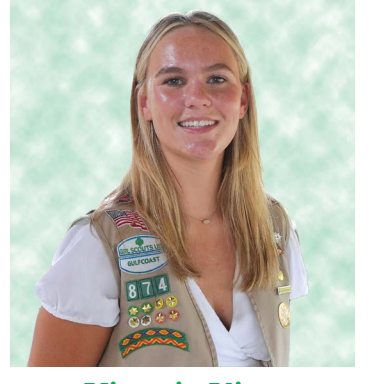
Victoria King Volleyball for Confidence Watch Victoria's Gold Award Video